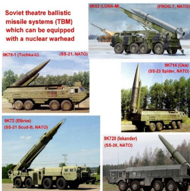
Fig. 3. Soviet/Russian theatre Ballistic Missile (TBM) Systems which Can be Equipped with a Nuclear Warhead (Explosion Yield up to 200 kt)

Secondly, it appears that it is not that simple and that missile systems have been in existence for some time that an anti-missile system is not capable of defending against, that is to say it is not possible to protect the national infrastructure from HEMP attacks. What sort of systems are these then? First of all, these are theatre ballistic missile (TBM) systems which can be equipped with a nuclear warhead, Fig. 3.