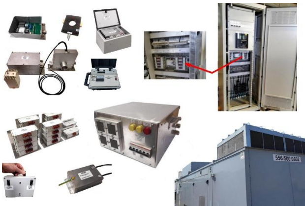
Fig. 5. EMP protective means developed by author: power transformer protection, power main DC simulator, protection of control cabinets with electronic digital equipment, special EMP filters for civil equipment, automatic reserve EMP protected battery charger for electrical substations, Ethernet telecommunication protective module, and even protective means for high power backup diesel generators.

In accordance with the specific strategy for the protection of civilian infrastructure previously proposed by the author, he also developed specific means of protection, which are installed in trial operation and have already been tested in several electrical substations during 2 – 3 years, Fig. 5.