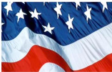
Critical Infrastructure Security and Resilience Research, Development, Test, and Evaluation Spend Plan

Well, what about civilian critical infrastructure protection? Today, at least a hundred organizations around the world are dealing with this problem (there are more than 50 of them in the United States only), dozens of detailed reports have been published on this topic, which are freely available on the Internet [4], as well as hundreds of articles and books. Dozens of standards (civilian and military) describe how to protect critical infrastructure equipment against HEMP [4].