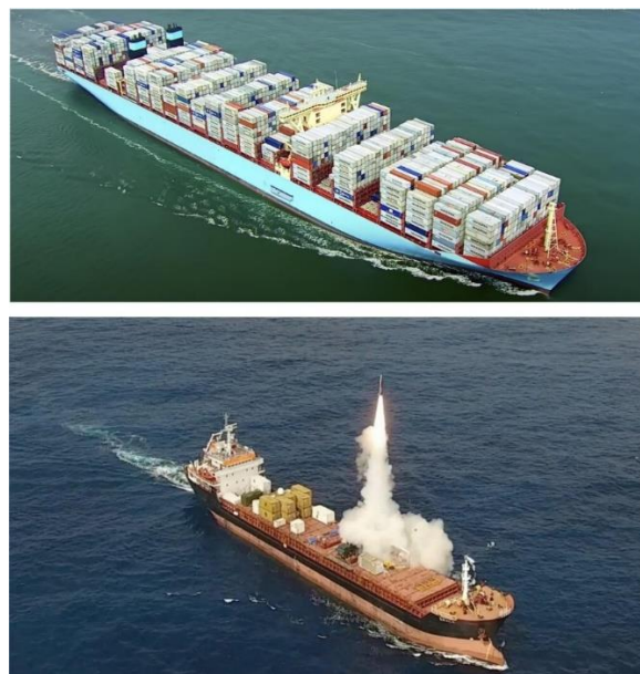
Fig. 5. An Ordinary Civilian Container Ship Loaded with Hundreds of Standard Containers and a LORA Rocket, Launched from a Ship with Containers During a Test Launch