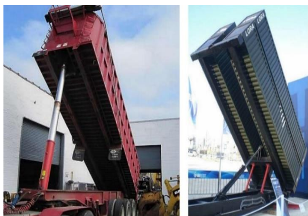
Fig. 4. A Conventional Shipping Container (Left) and a LORA Missile System Container (Right)